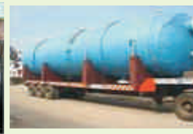
SS Reaction Tower