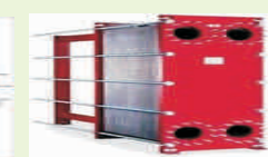
Heat Exchanger Plates