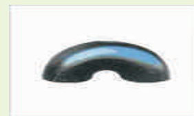
SS Pipe Bend