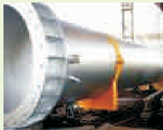
SS Reaction Column