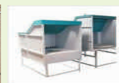
SS Cabinet / Clean Room