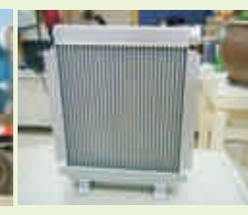
SS Finned Radiator