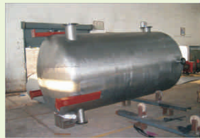
SS Reaction Kettle