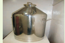
SS Storage Vessle

INNOVATIVE COATING INDUSTRIES : ( A PROMTECH Consultancy Group Company )