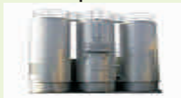
SS Vertical Storage Tanks