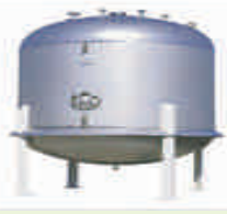
SS Reacion Kettle