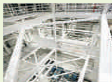
SS Fabrication In PHARMA Plant