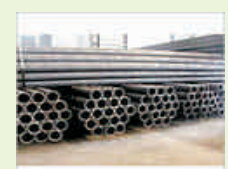
SS Welded Tubes