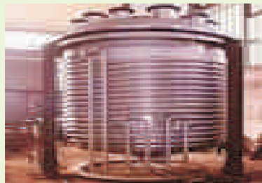
Lympet Coil Vessles

VAT 12.5 % : Forwarding Charges Rs 300 for any quantity : PAYMENT : Cash / Cheque / RTGS Bank Transfer :