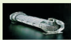
Heat Exchanger Pipe Bundle