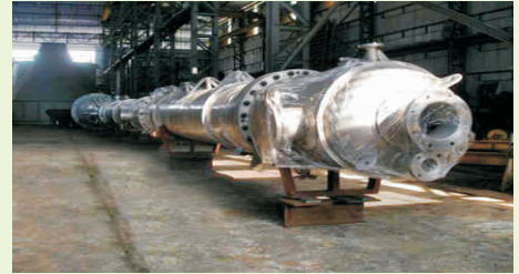
SS Reaction Tower