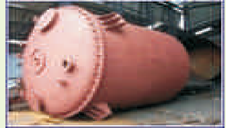
SS Reaction Vessles