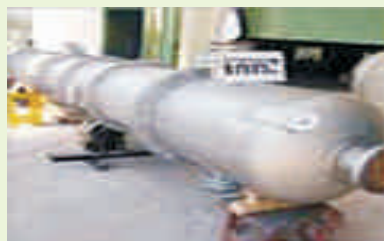
SS Condenser Unit